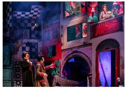
Figaro arrives and they overhear Rosina's guardian, Dr Bartolo, saying that he intends to choose Rosina's husband.