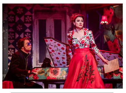
Rosina wants to choose who she marries, but Bartolo has planned for her to get married that evening.