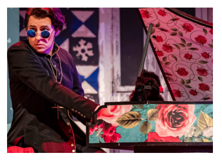
Count Almaviva, in disguise as a student called Lindoro, serenades Rosina at her window. He has falled in love with her.