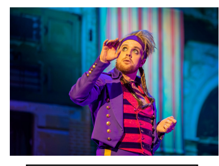
Figaro says that he will help the count get into Bartolo's house so that he can speak to Rosina. The count will pay Figaro for his help.