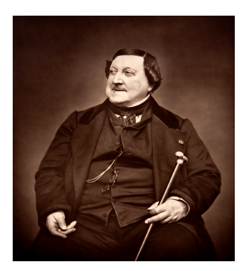
Gioachino Rossini Born 29 February 1792 in Pesaro, Italy.

The composer is the person who makes up and notates the melodies, makes the librettist's words fit to the music, and creates and writes down what the orchestra needs to play.