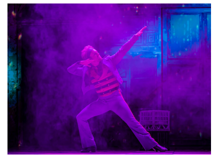
Rosina and The Count get married and Figaro get's his money!